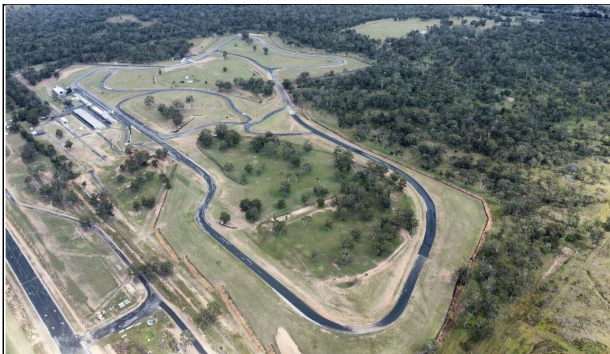
Morgan Park in all it's glory.

With Periods 3 ,4 & 5 ultra lightweight machines all bundled together on the track, the long track was sure to bring a level of mosquito mayhem and watching close to twenty mosquitoes on the limiters was one of the highlights of the week.