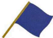
Blue Flag Stationary - motorcycle coming up behind; Waved - motorcycle about to overtake