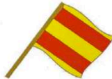
Red & Yellow Striped Flag Track surface slippery