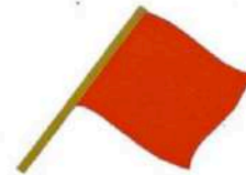
Red Flag Displayed motionless - race or practice session stopped