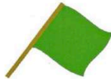
Green Flag All Clear (riders free to overtake)