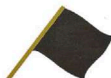
Black Flag Riders whose number is shown with the flag must stop at the pits on the next lap