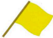
Yellow Flag Waved - Danger ahead; Stationary - Used at preceding marshalling post